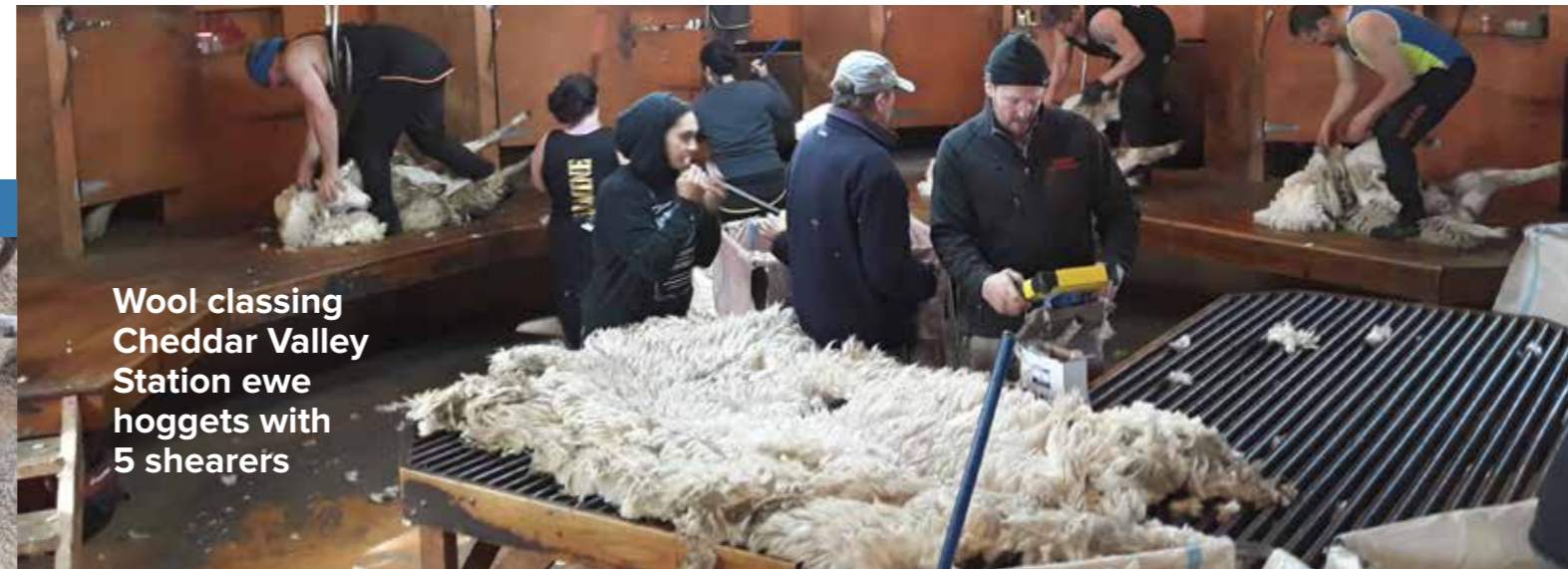
Wool classing Cheddar Valley Station ewe hoggets with 5 shearers

Snowline™ is a stabilised true xbred type sheep with mid micron wool. There have been no merino or 1/2 bred genetics added to our flocks. We have achieved our mid micron wool, by using population genetics and selection within our 4300 female ram breeding Snowline™ flocks .